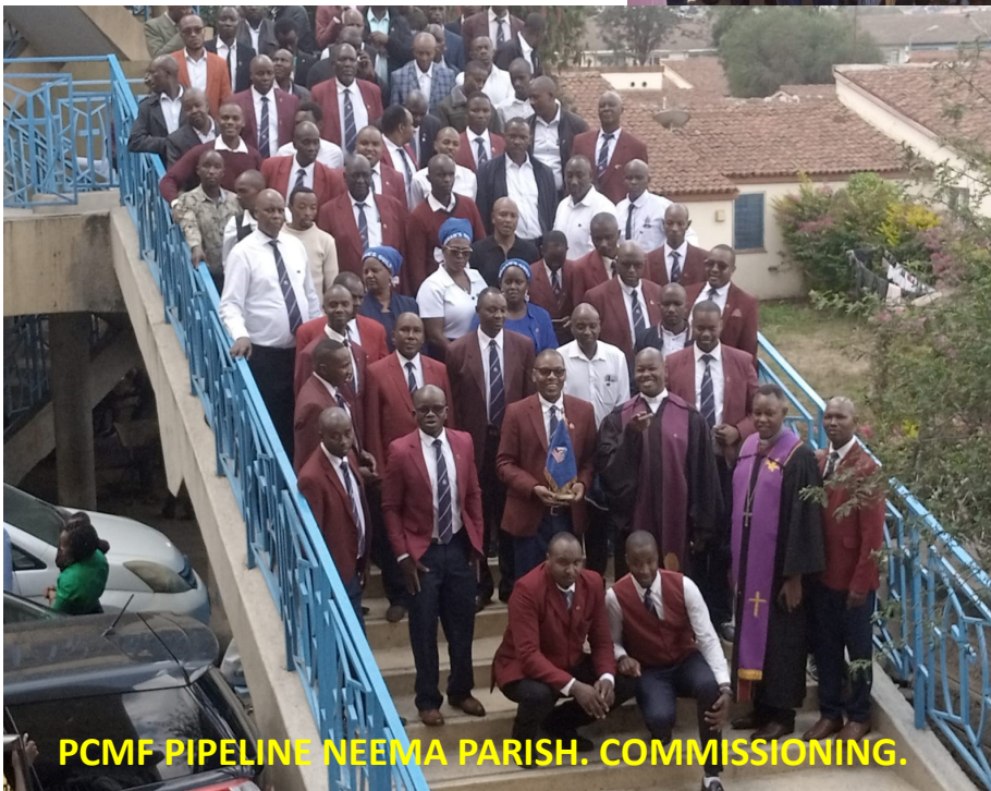
PCMF PIPELINE NEEMA PARISH. COMMISSIONING.