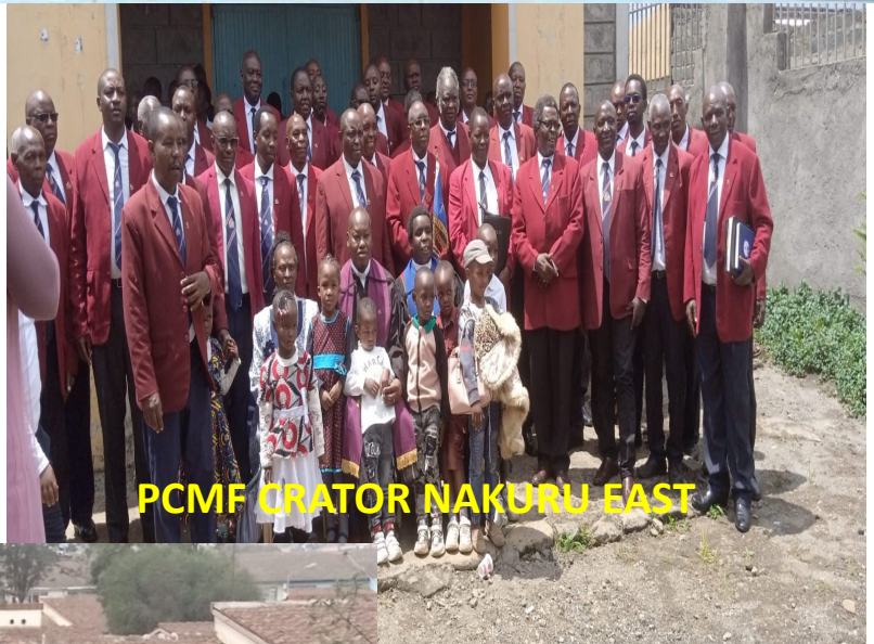
PCMF CRATOR NAKURU EAST