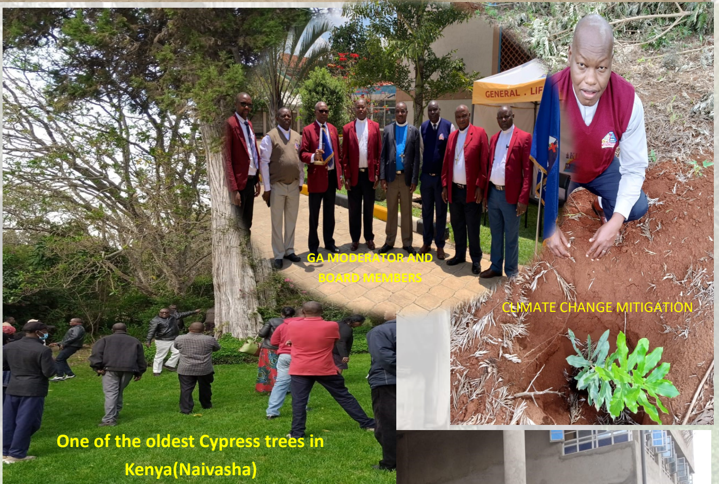
GA MODERATOR AND BOARD MEMBERS