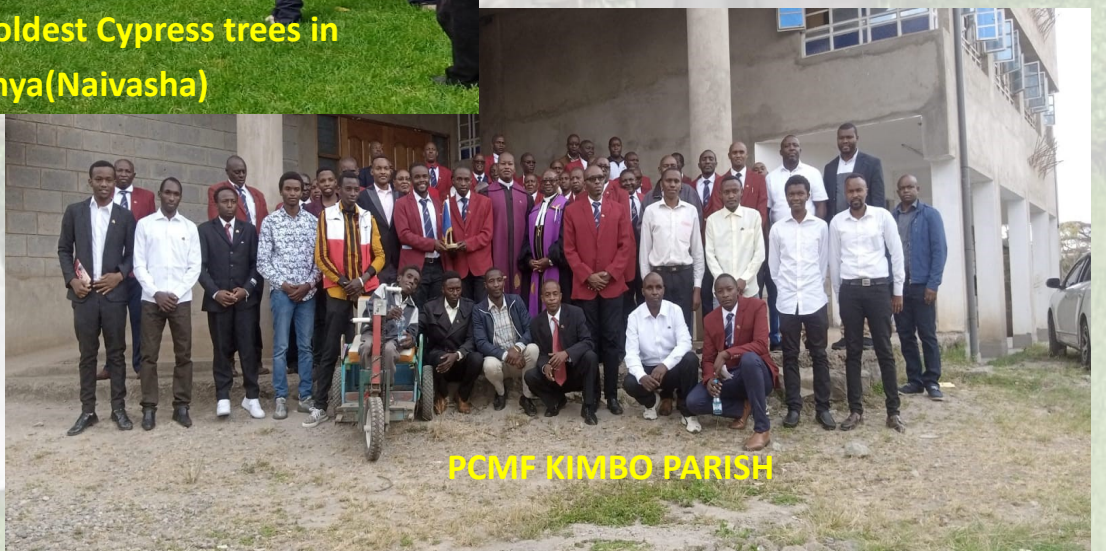
PCMF KIMBO PARISH